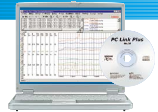
Example of PC Link Plus screen

The PC Link system is the software dedicated to a PC for retrieving data outputted from a SANWA digital multimeter (PC series). The operation screen displays graphs in real time to allow you to check changes in measured values (voltage, current, etc.) with ease. Measured data can be saved on a CSV file, so it is easily processed on Excel. The ease of use in a variety of applications from data retrieval, processing and analysis results in its extensive acceptance for business, education and personal use.